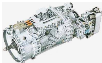
ZF Traxon Hybrid robotized transmission with 120 kW electric motor

The vehicles being developed will ensure no less than 15% fuel saving in unfavourable climatic and road conditions, as well as improved stability and flotation ability on slippery roads.