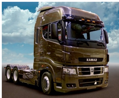
Front axle electric motor YASA-400